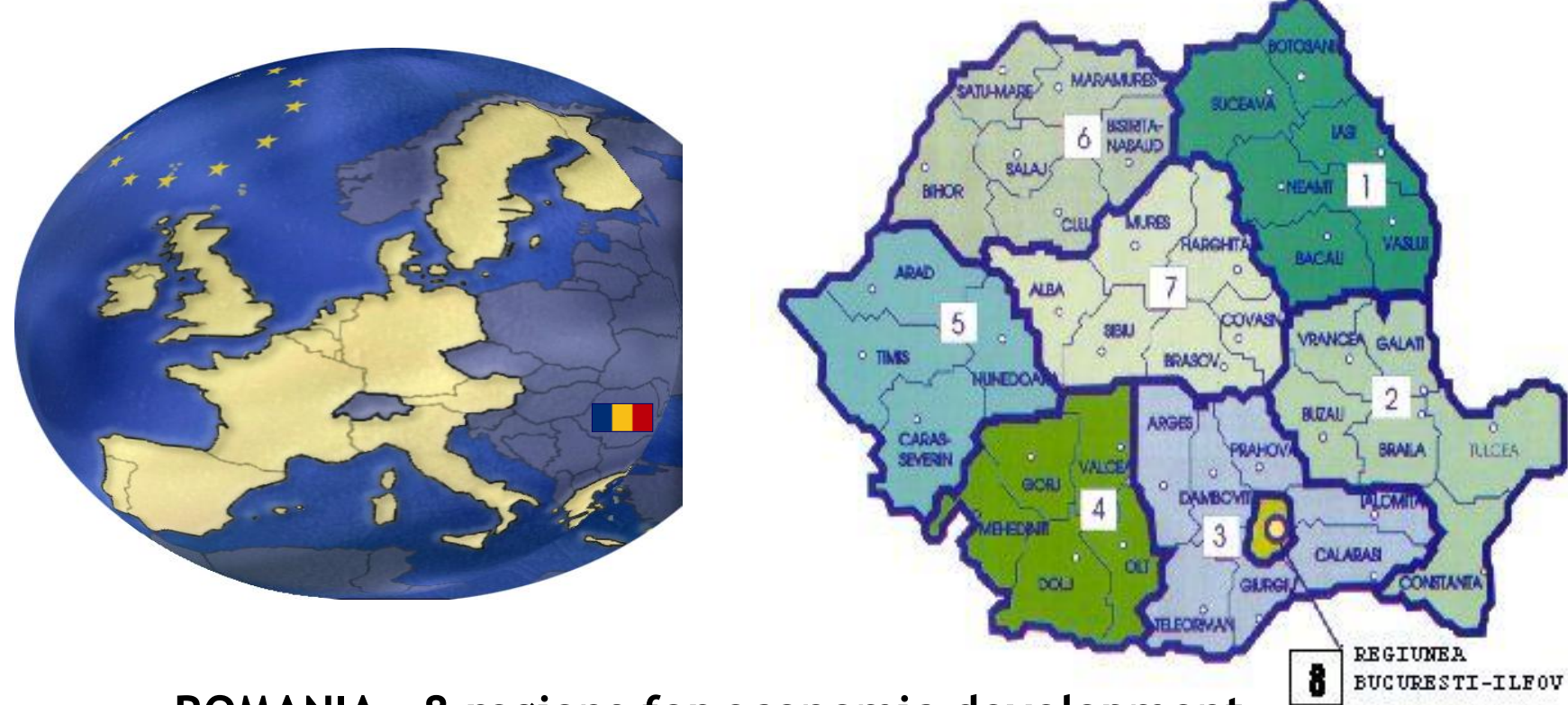
ROMANIA - 8 regions for economic development Law nr.315 / 2004

Targeting the development priorities of Romania and the EU objectives